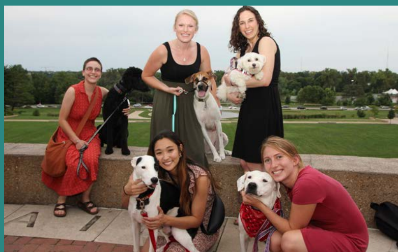
Students (and their canine friends) enjoyed the annual orientation picnic held in Forest Park on Aug. 29.