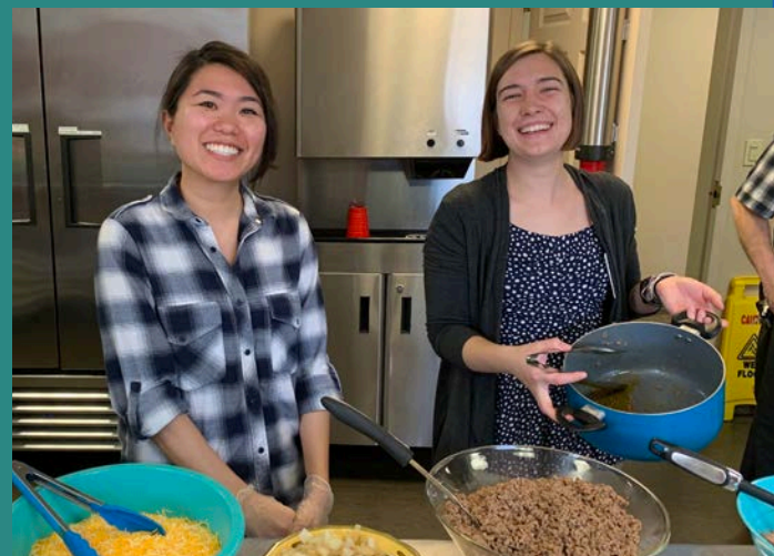
Students prepared and served a hot meal to approximately 50 individuals undergoing cancer treatment and staying at the American Cancer Society Hope Lodge on March 27.