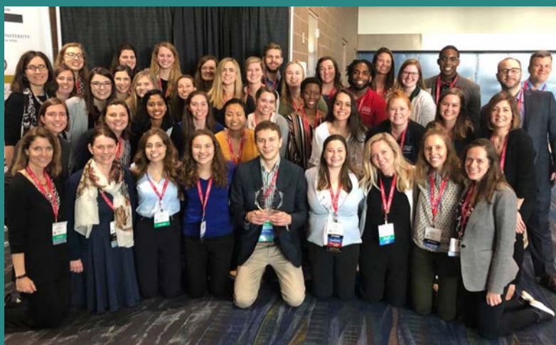
Washington University received the 2019 St. Catherine Challenge MVP Award at AOTA's Annual Conference & Expo in New Orleans on April 6. Students raised $3,032 to support occupational therapy research grants awarded by the American Occupational Therapy Foundation.