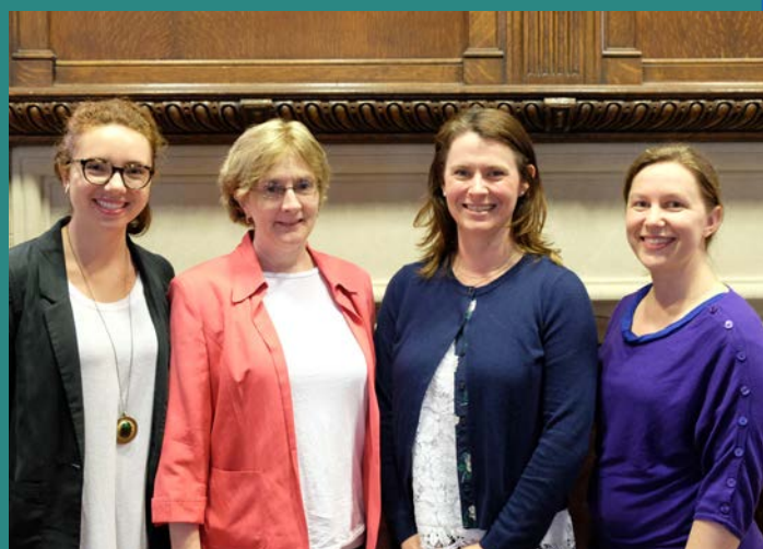
Three students were honored at The Teaching Center's Annual Graduate Student & Postdoc Recognition Reception on May 2. The event recognized and celebrated the graduate students and postdocs who have shown a dedication to teaching.