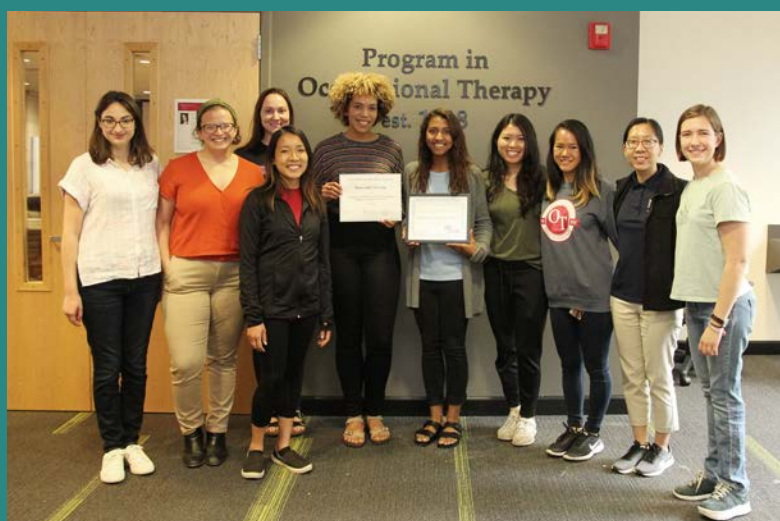
Our Coalition of Occupational Therapy Advocates for Diversity (COTAD) student chapter was awarded the 1st COTAD Chapter Excellence Award for demonstrating action toward annual initiatives and passion for diversity/inclusion.